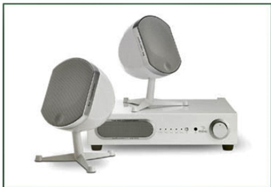
SYSTÈME FOCAL BIRD 2.1 999.00$ À 1,499.00$ M.S.R.P.